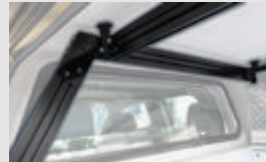
Interior Skeleton View